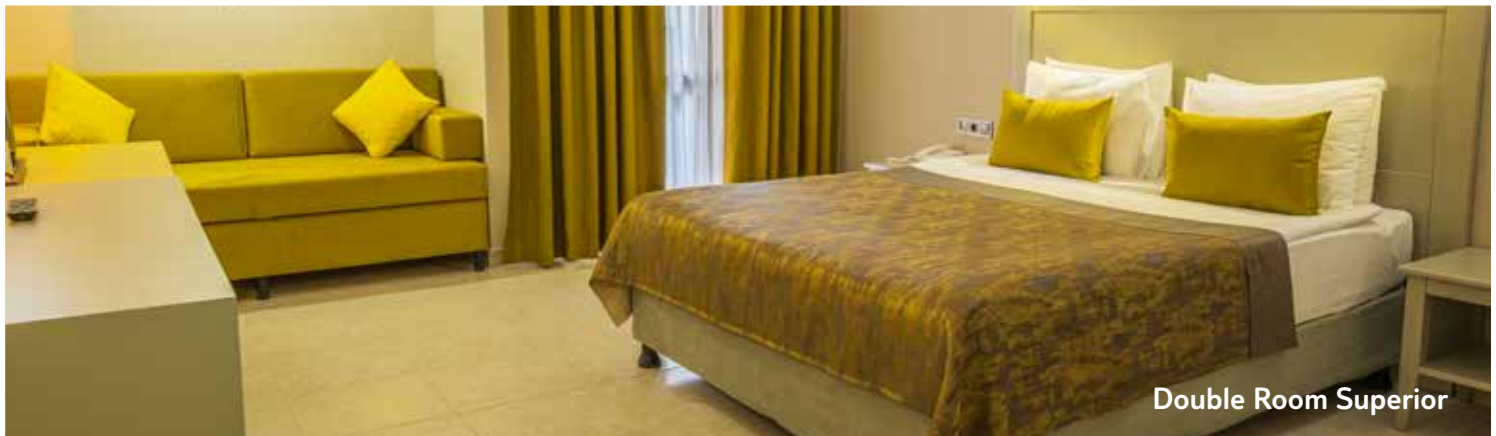
Double Room Superior

6 units (included in the total number of standard rooms), consists of one bedroom with twin bed. With wheelchair access to the balcony. (6 Twin bed)