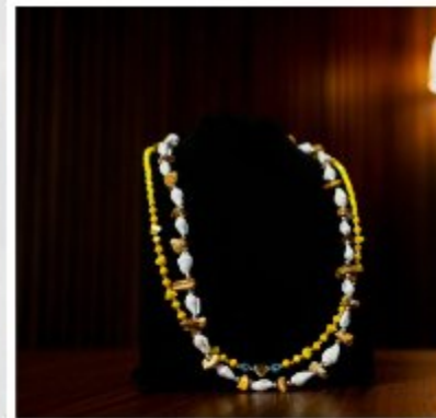
Natural Sea Necklace