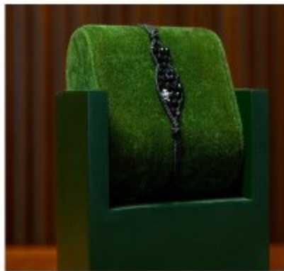
Night Glow Bracelet