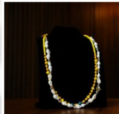
Summer Breeze Necklace