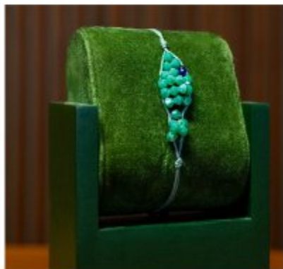
Peace of Nature Bracelet